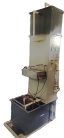
Solar Water Pump Test Rig