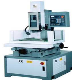
EDM Drilling Machine