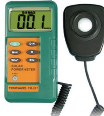
Solar Power Meter