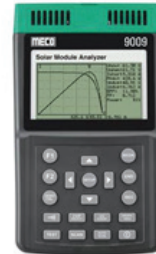
Solar Module Analyzer