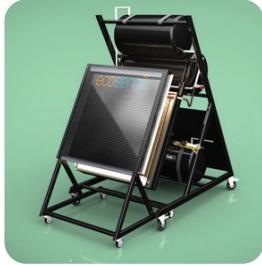
Solar Thermal Training System